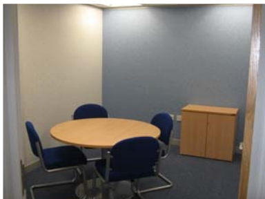
New Meeting Room Facilities

Rail House, Crewe is a Multi Tenanted 13-Storey Building located adjacent to the Railway Station in Crewe.