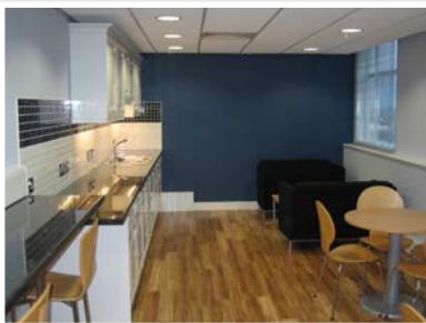
Kitchen Breakout Area

Including Building Fabric, Mechanical & Electrical Services, Structured Cabling Infrastructure and Comfort Cooling.